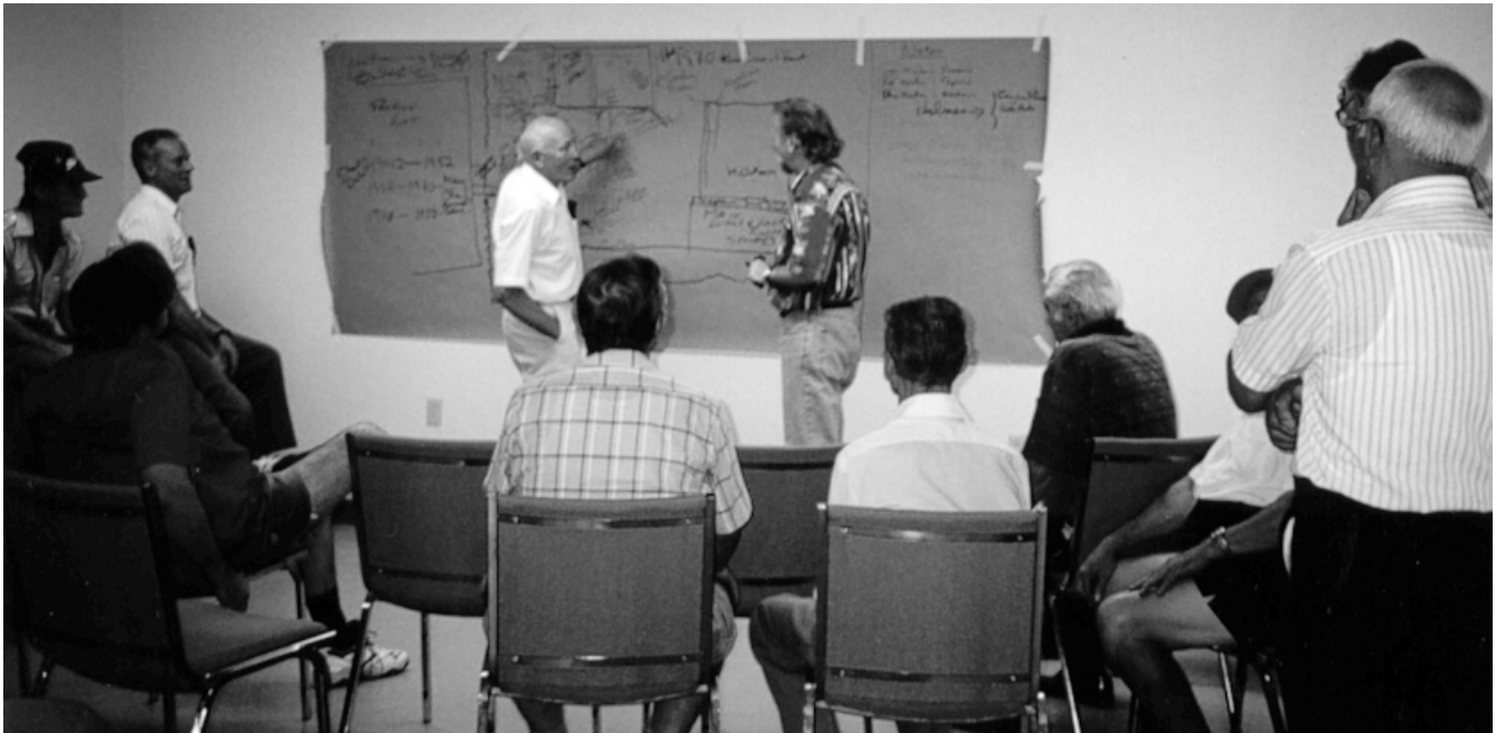
Figure 1—Holmes Foundry hazard mapping.

into the Holmes foundry lunchroom to eat. They recalled that they had “no respirators” and were “not told that asbestos was dangerous.”